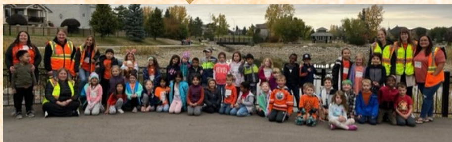
Grade 1 Run for Reconciliation @ Park Meadows

Fleetwood Bawden celebrated National Day of Truth and Reconciliation and the start of the year with a school smudge. Students in Grade 3/4 also participated in making Faceless Dolls.