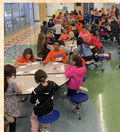
Circle of Courage @ Buchanan