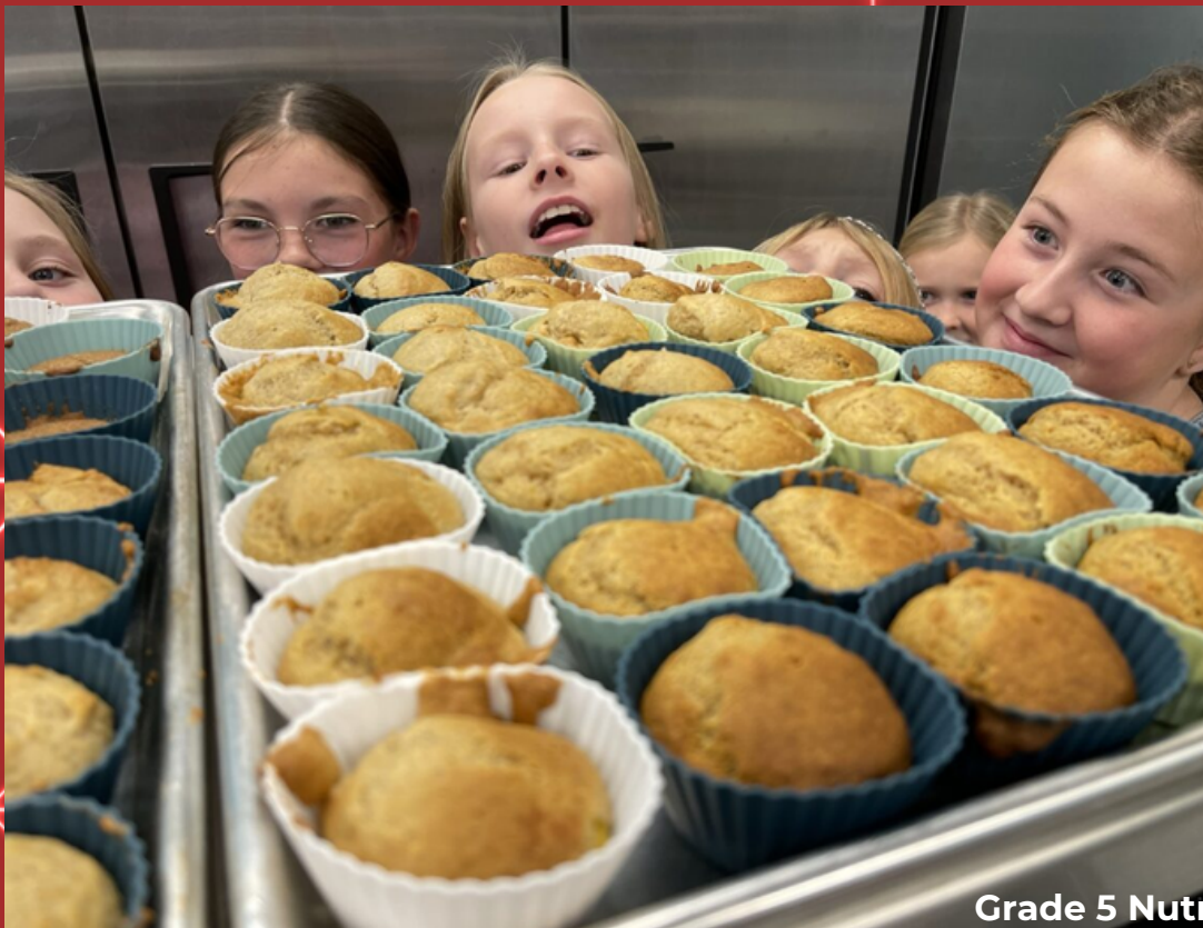
Grade 5 Nutrition Baking