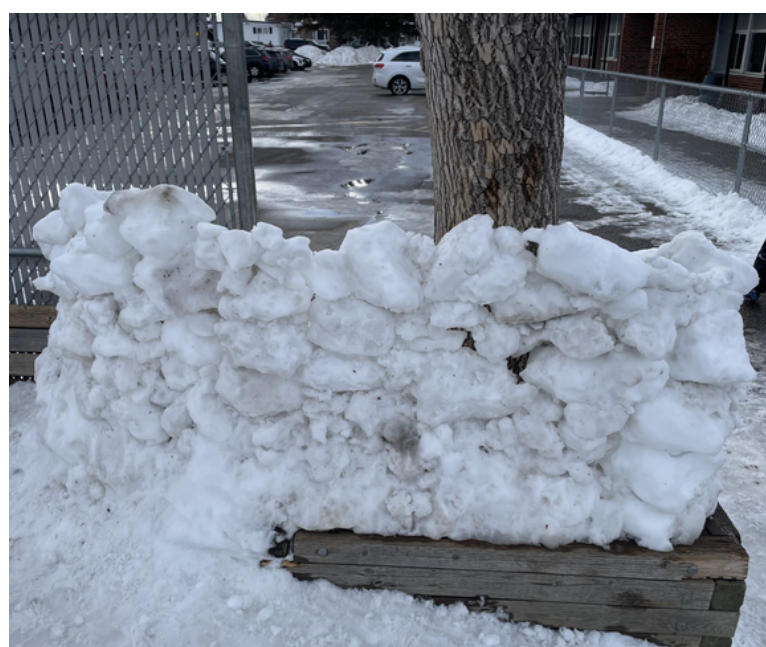
Agnes Davidson students built an igloo!