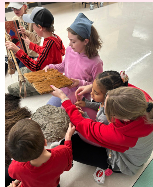
Buffalo Kit @ Plaxton