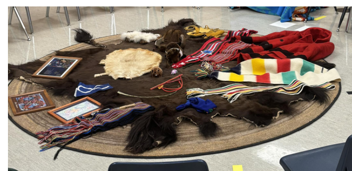
Carnival @ Agnes Davidson