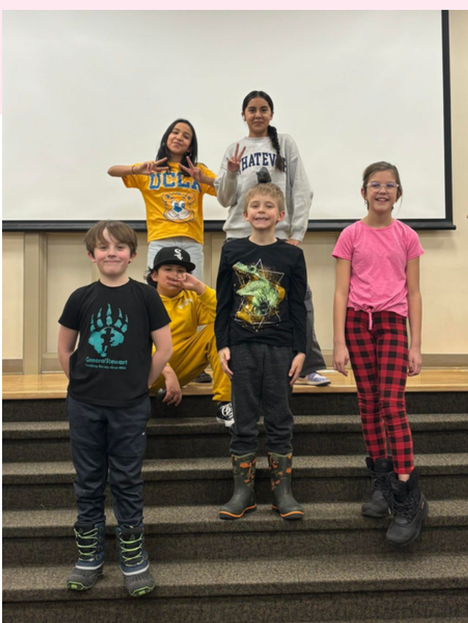
General Stewart Orange Shirt Day collaboration