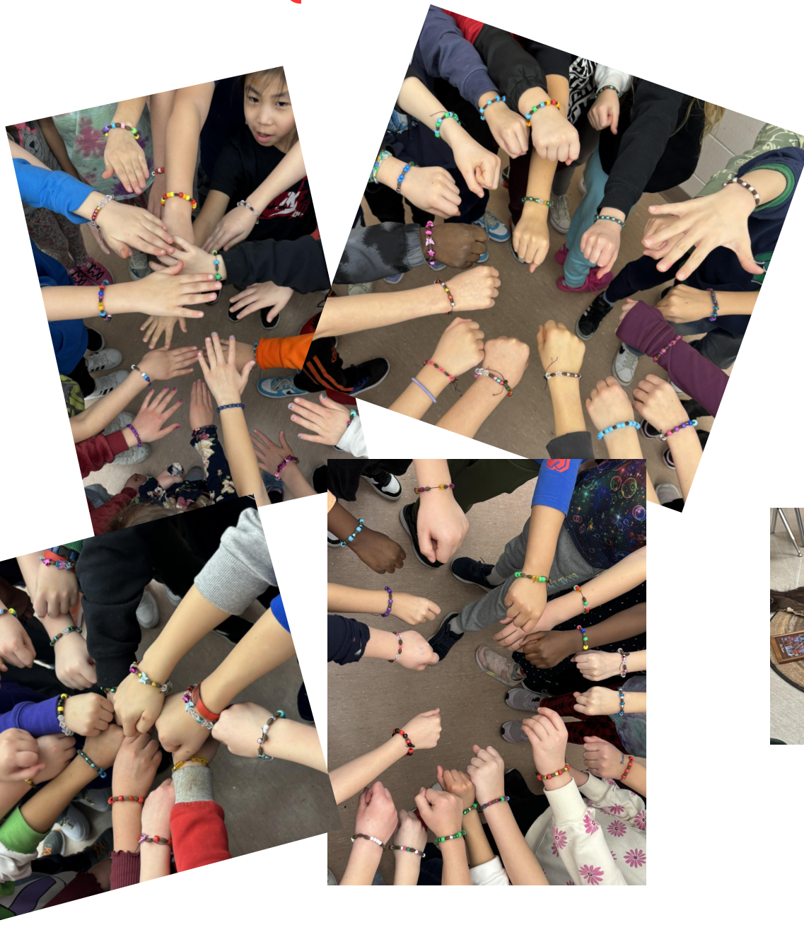
Wolf Willow bracelets @ Probe