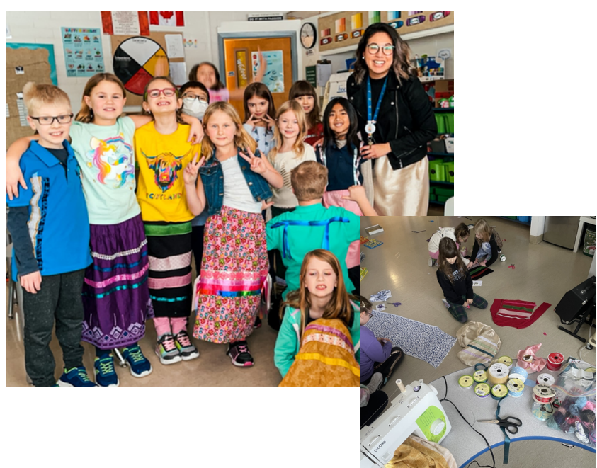
Ribbon skirt/dress making at Senator Buchanan