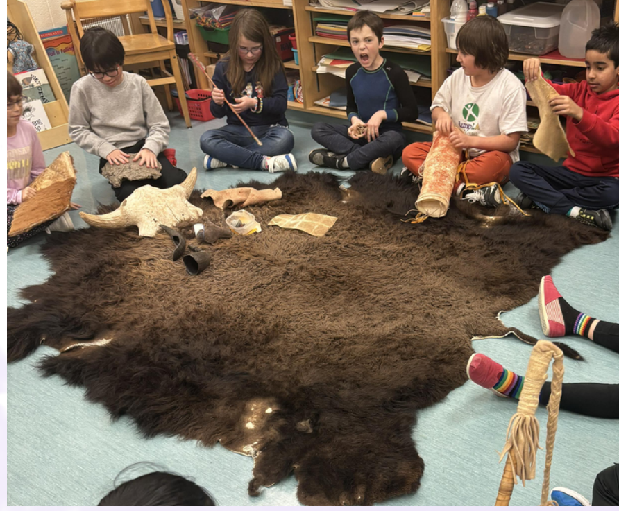
Buffalo Kit @ Fleetwood