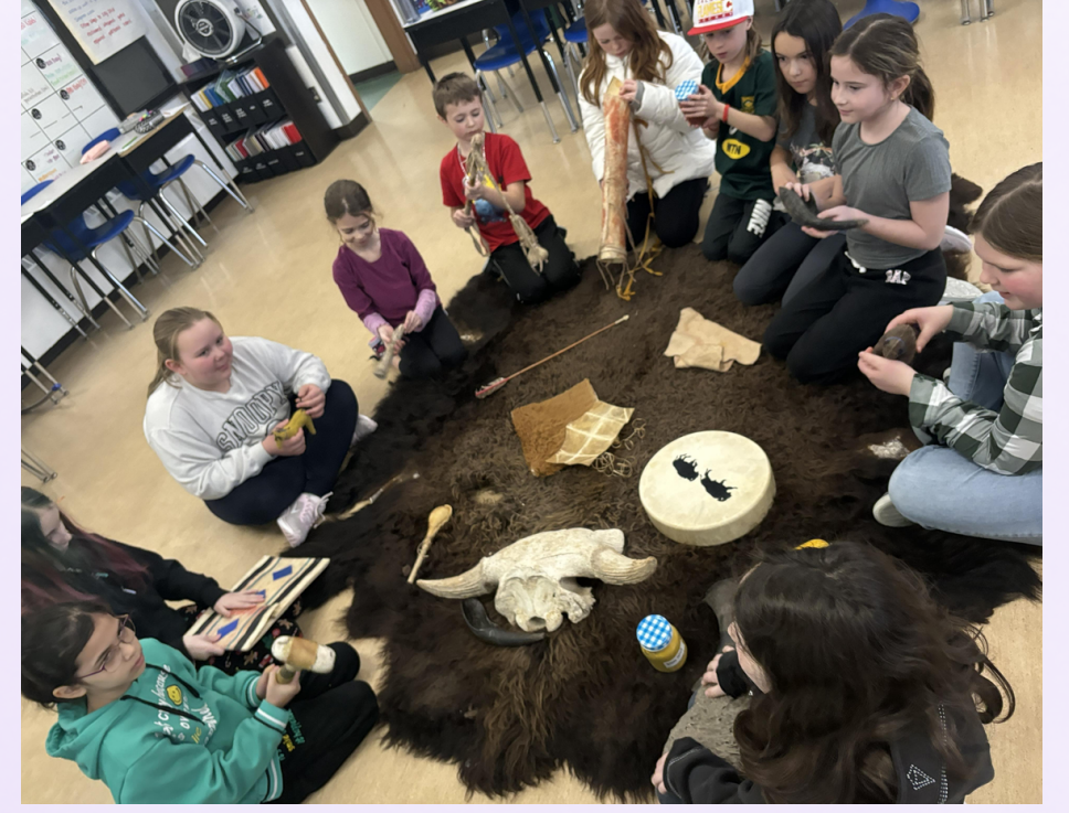
Buffalo Kit @ Park Meadows