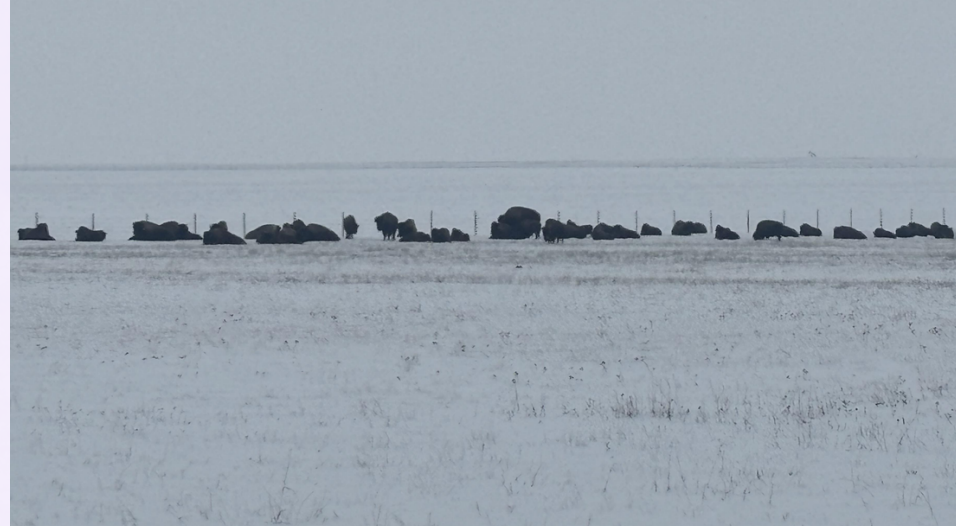
Learning about the Buffalo on the Blood Reserve