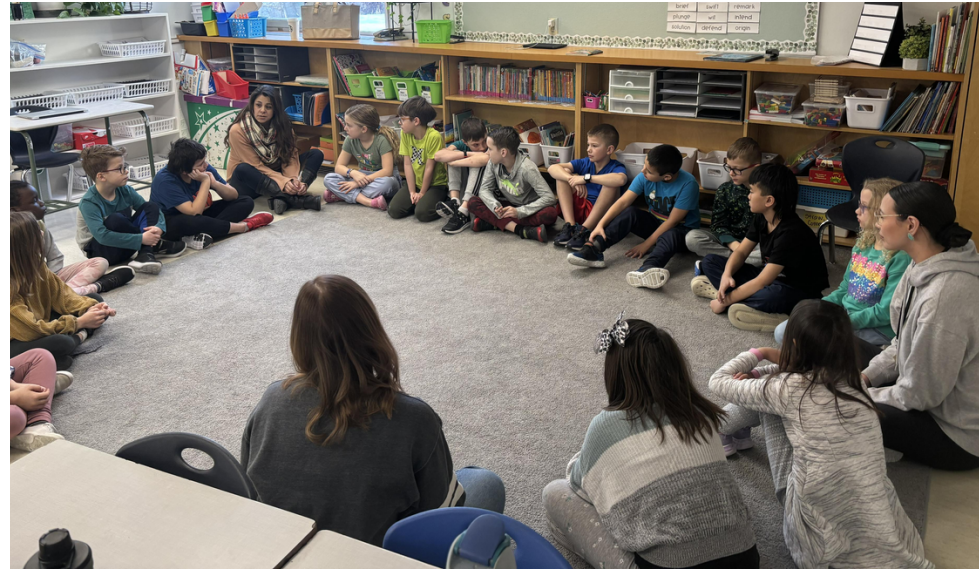
We got to attend a Sharing Circle @ Nicholas Sheran