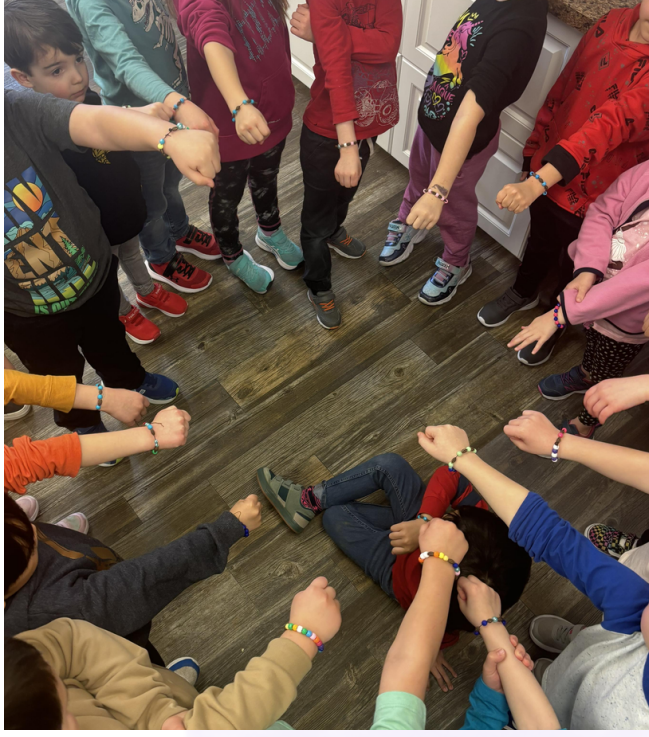
Wolf Willow Bracelets @ ICES