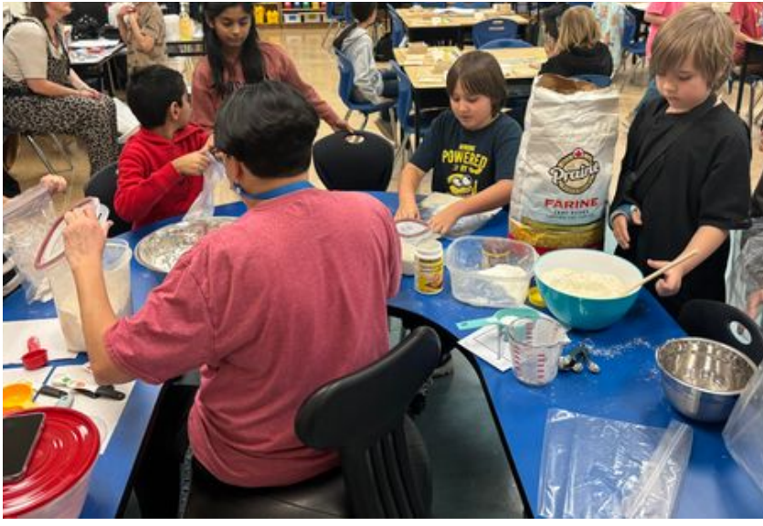
Made Bannock @ Fleetwood