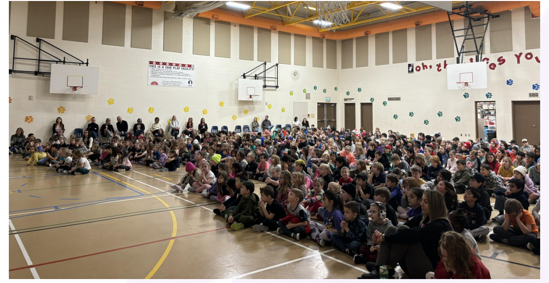
Learning about the Buffalo @ Probe